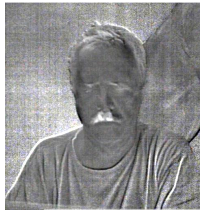
Polarized image acquired in LWIR