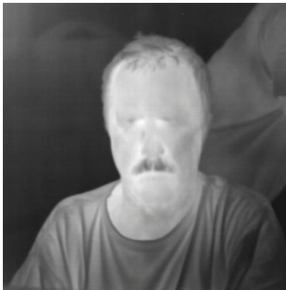
Regular image acquired in LWIR